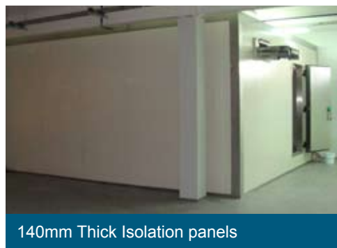
140mm Thick Isolation panels